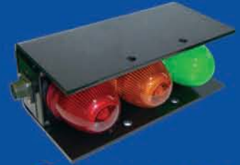
2 Exterior loading indicator lights (optional)