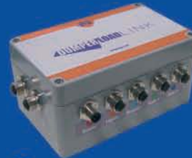
3 Dumper Load Link inputs device