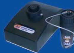
DLogger kit data transfer from Dumper Load to PC. USB B UNIVERSAL SERIAL BUS