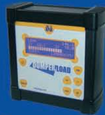
1 Dumper Load On-board instrumentation