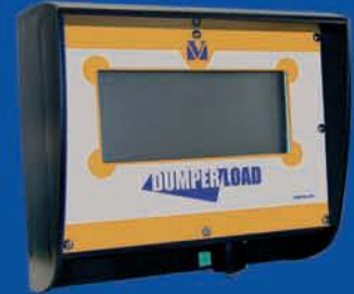
2 Exterior loading indicator display (optional)